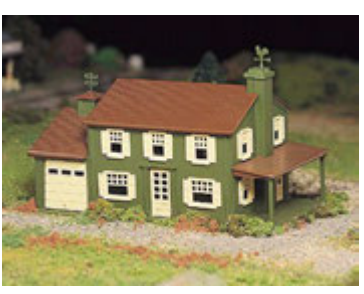
45622 Two Story House $10.00