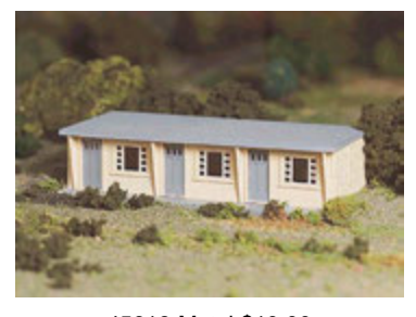
45618 Motel $10.00