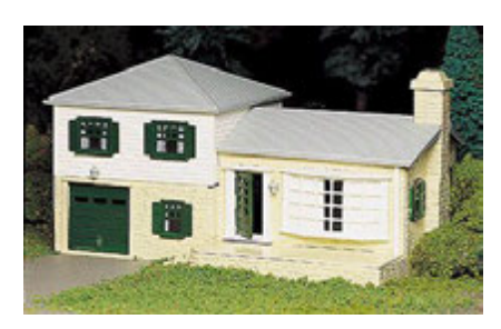
45607 Split Level House $15.00