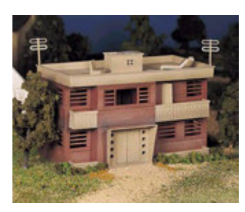
45980 Apartment Bldg. $10.00