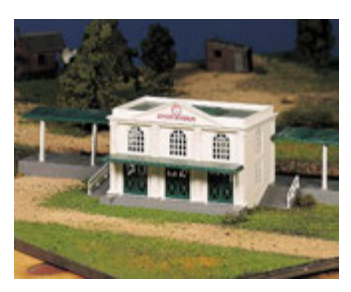
45976 Union Station $10.00