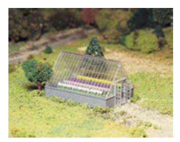
45615 Greenhouse $10.00