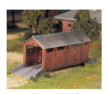
45992 Covered Bridge $10.00