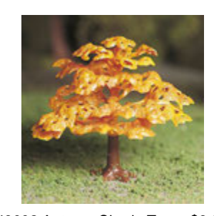
49002 Autumn Shade Trees $6.00