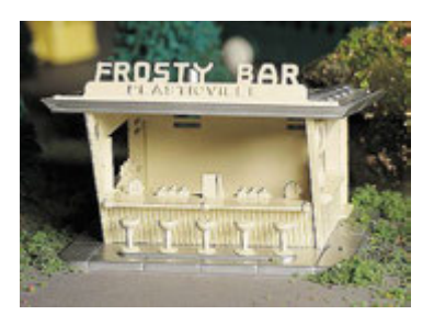
45606 Frosty Bar $6.00

Having a hard time finding a special gift for someone? No problem. We have hundreds of products in our store including many of those hard-to-find items and if they live out of town we can even ship it directly to their front door. If you have any questions please be sure to give us a call or send us email to hobby@starhobby.com. Remember, if you don't see it we'll order it!