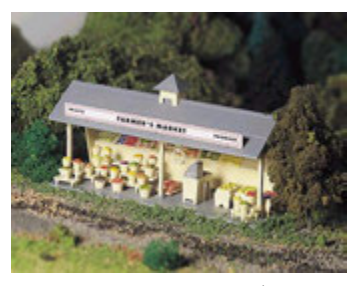
45621 Roadside Stand $10.00