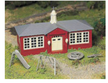
45611 Schoolhouse $10.00